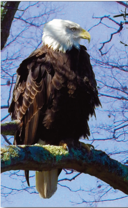
An eagle perched in a tree overlooking the lake...